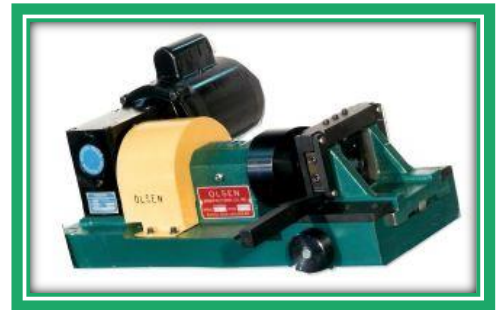
Model 50 Flaring Machine