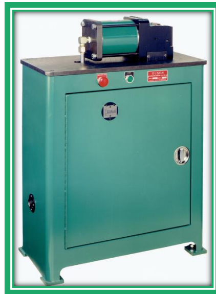
Model 20 Double Flare